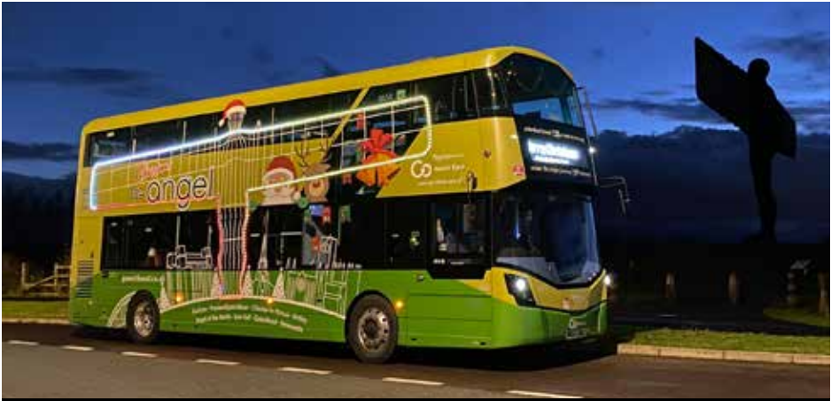
Go North East's Wright StreetDeck 6315 has received seasonal adornments including having the illumination of the representation of 'The Angel of the North'. It has also received Christmas graphics.