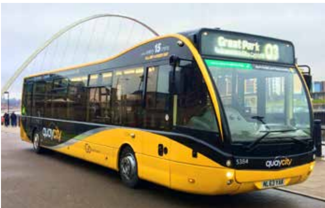
The new image for Go North East's 'QuayCity' service, which is now carried by nine Optare Versas - 5380-88.