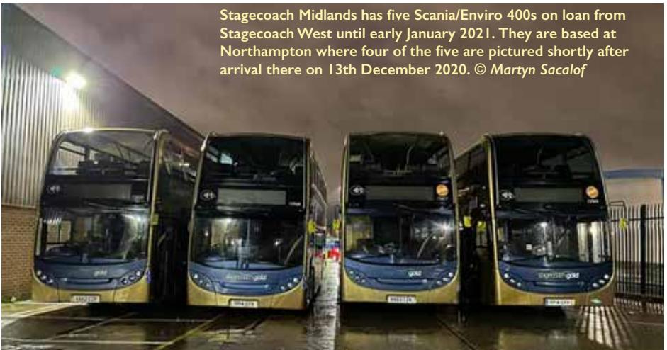
Stagecoach Midlands has five Scania/Enviro 400s on loan from Stagecoach West until early January 2021. They are based at Northampton where four of the five are pictured shortly after arrival there on 13th December 2020.

Van Hool Astromegas 50261-68 are confirmed as having been transferred to Stagecoach East Scotland with 50280-81 moving to Stagecoach West Scotland. Further departures from Oxford, believed to be to Stagecoach West Scotland, on 18th December 2020 were 50277/78/79.