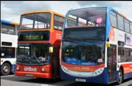
A day out at the 2015 event for Trident/ALX400 17054 (T654KPU), which at the time was part of the Stagecoach Midlands fleet at Leamington and carried 'Unibus' livery. It is parked next to Scania/Enviro 400 15677 (KX10KTG) which also carries branding, this for the X15/X18 Stratford-Coventry service.

Stagecoach London are one of the many Stagecoach companies that provide drivers and vehicles for the Grand Prix shuttles. Having dropped its passengers back at Sixfields in 2015 is Scania 15081 (LX09AFN). This bus is now with Stagecoach East and based at Cambridge depot.