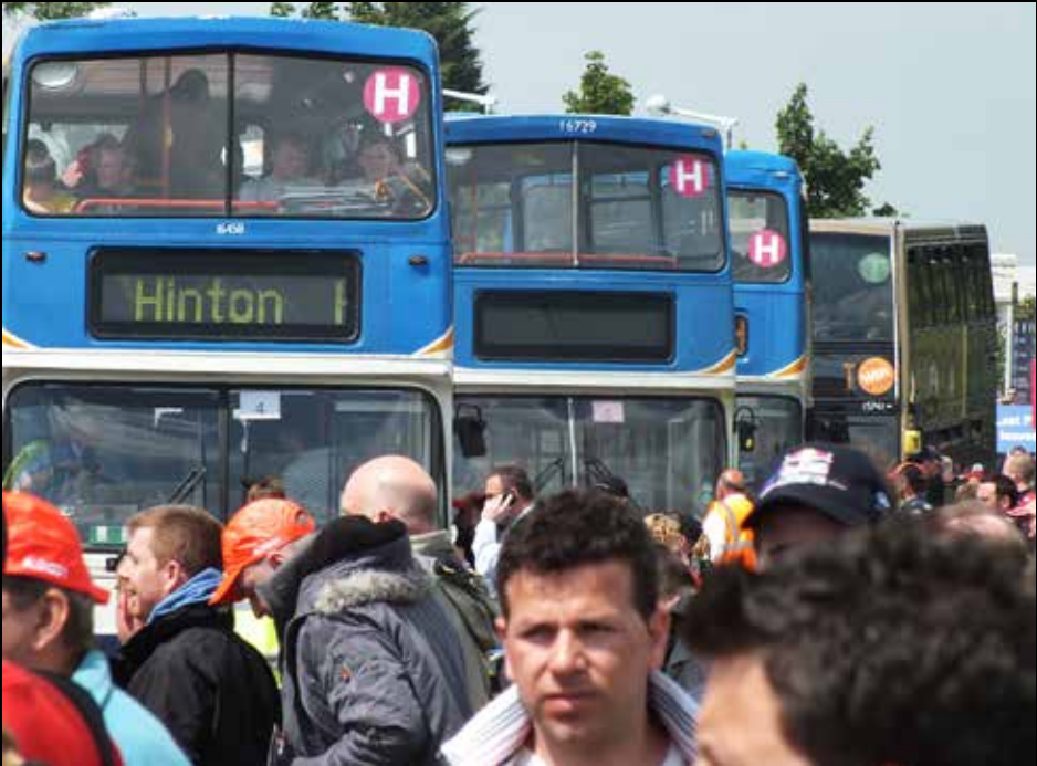
The end of the day and a busy scene at Silverstone's temporary bus station as Alexander RL-bodied Volvo Olympians 16458 and 16729 load for the Hinton Park & Ride site whilst in the background Stagecoach Gold Scania/Enviro 400 15741 is on a service to Towcester.