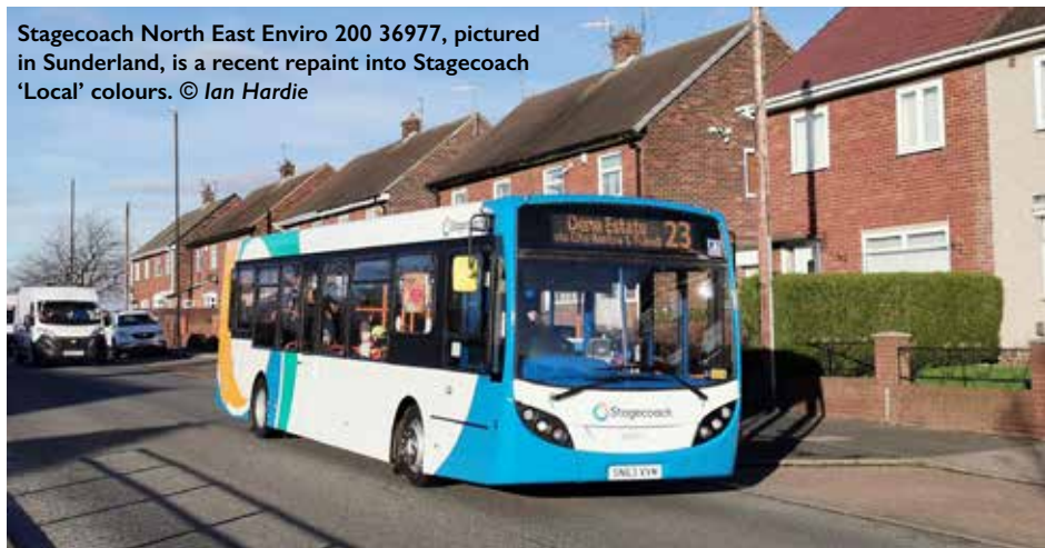
Stagecoach North East Enviro 200 36977, pictured in Sunderland, is a recent repaint into Stagecoach 'Local' colours.

Additional Enviro 400H Hybrids now in the Magicbus fleet are 12239 at Sharston and 12232/51 at Hyde Road.