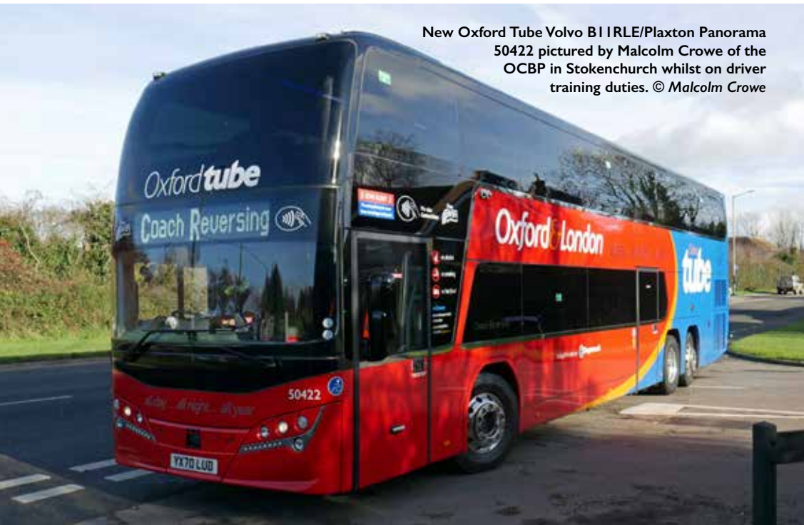
New Oxford Tube Volvo B11RLE/Plaxton Panorama 50422 pictured by Malcolm Crowe of the OCBP in Stokenchurch whilst on driver training duties. © Malcolm Crowe

The Van Hool Astromegas displaced by the arrival of the new Plaxton Panorama coaches are expected to be cascaded for further use within Stagecoach UK.