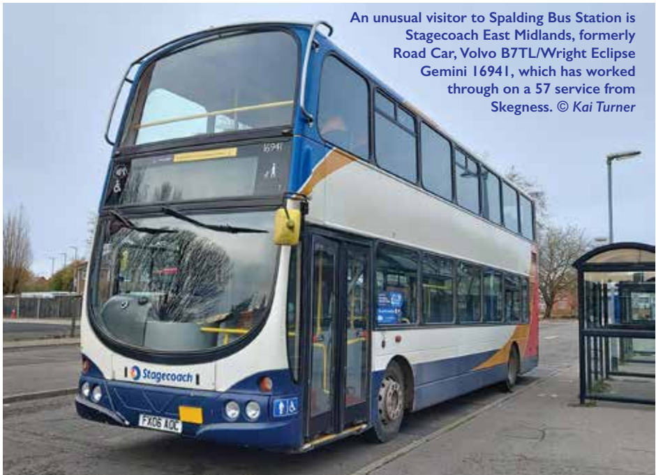
An unusual visitor to Spalding Bus Station is Stagecoach East Midlands, formerly Road Car, Volvo B7TL/Wright Eclipse Gemini 16941, which has worked through on a 57 service from Skegness.