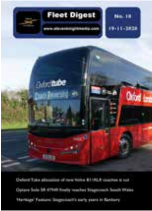
New Oxford Tube Volvo B11RLE/Plaxton Panorama 50422.

© Steven Knight Media 2020 Steven Knight Media PO Box 1299 Peterborough PE2 2NX