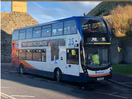
Stagecoach North Scotland [Bluebird] operates 24 buses and coaches from its Macduff depot. These include 15 ADL Enviro 400MMC SmartHybrids, three Enviro 200s, one MAN/Enviro 300, one Optare Solo and three Volvo B9R coaches. Pictured at the depot (above) are Enviro 400MMC SmartHybrids 11166 and 11175 along with Volvo B9R/Plaxton Panther 53632. (Left) is ADL Enviro 400MMC SmartHybrid 11161 working the 35 service for which they carry branding..