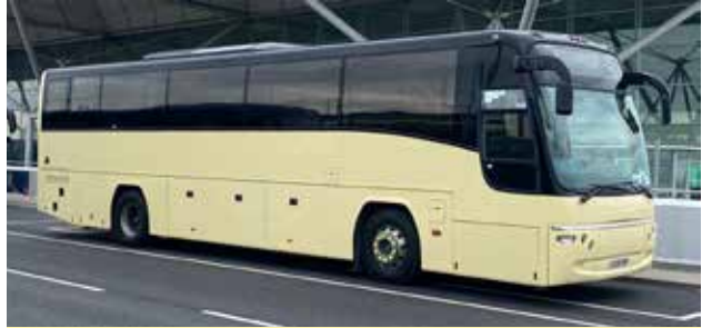
Former Stagecoach East Midlands Volvo B9R/Plaxton Panther now with Blands.

The two Volvo B9R/Plaxton Panther coaches that were sold to Blands near Stamford, 53601/02, have been re-registered from KX58NBJ/K to XIL7321 and HIL9272.