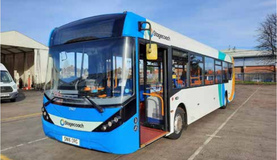
The first vehicle in the Stagecoach East fleet to receive Stagecoach 'Local' livery is ADL Enviro 200MMC 37437, which was pictured outside Bedford depot on 12th November 2020: